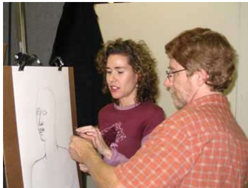
Figure Drawing Glen Miller

Turn your doodles into wonderful drawings! Start in the Museum art studios to learn the basic elements of drawing, including line, shape, value, form, and composition, then venture into the Museum galleries and out onto Heritage Green to sketch on location. This is an excellent opportunity for people who have always wanted to draw and for those looking to refresh their drawing skills. Instructor Marty Epp-Carter has a Masters of Fine Arts from Clemson University and a studio and gallery in West Greenville. Materials list mailed with confirmation.